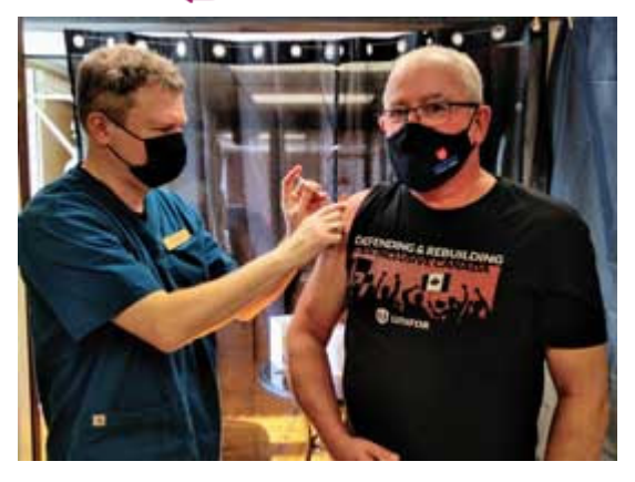
Unifor's National Executive Board issues statement on comprehensive